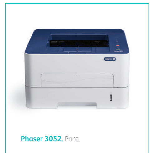
Phaser 3052. Print.