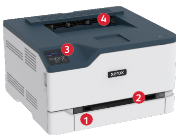
Xerox® C230 Colour Printer