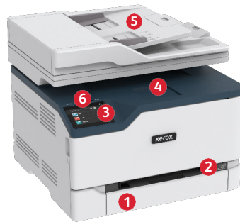
Xerox® C235 Colour Multifunction Printer